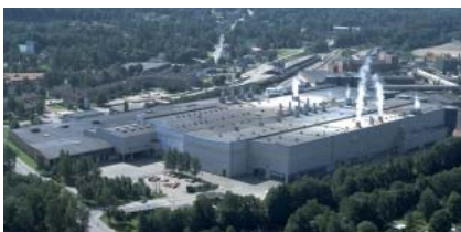
Since 1972, Hylte Bruk has been producing paper for newspapers.

In order to meet the requirements for a high level of reliability, Leine & Linde has developed an advanced diagnostic system, ADS™, for the incremental encoders in the robust